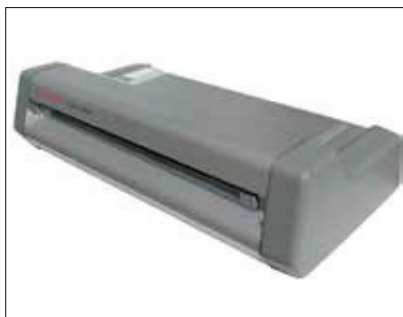
Very easy handling

Using this cutter is very easy and doesn't need a special training