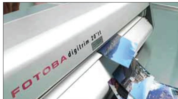
Can cut different sizes in the same roll (Digitrim nesting)