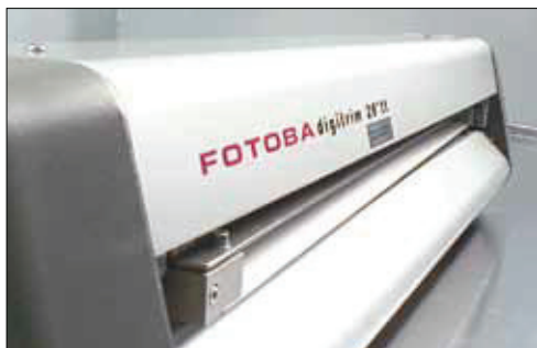
The self-squaring blade follows any printing misalignment