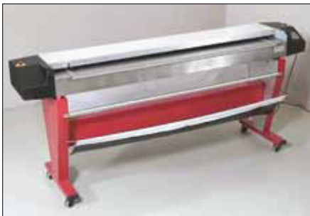
Very easy handling

Using this cutter is very easy and doesn't need a special training.